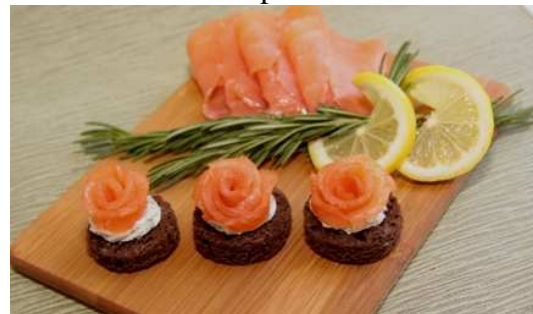
Smoked Salmon Roses

(818) 207-1649 (818) 363-8254 Fax www.ingridscatering.com