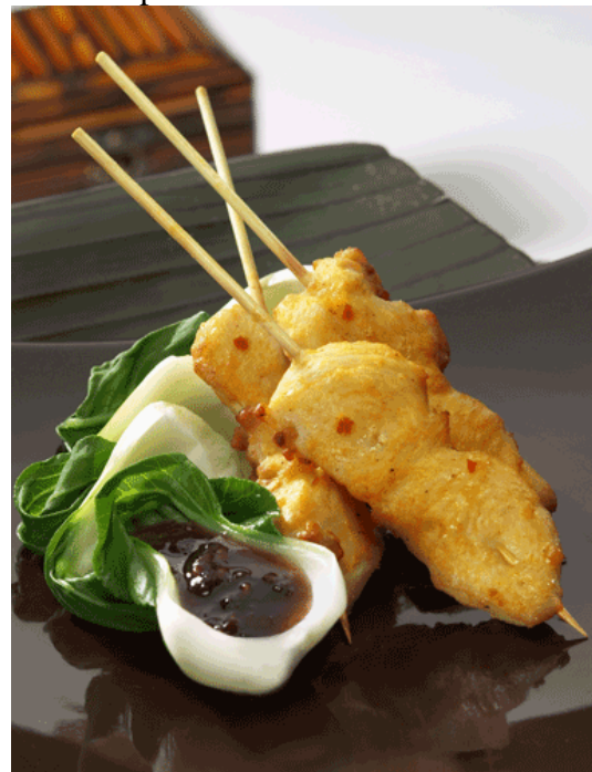
Thai Peanut Chicken Satay

(818) 207-1649 (818) 363-8254 Fax www.ingridscatering.com