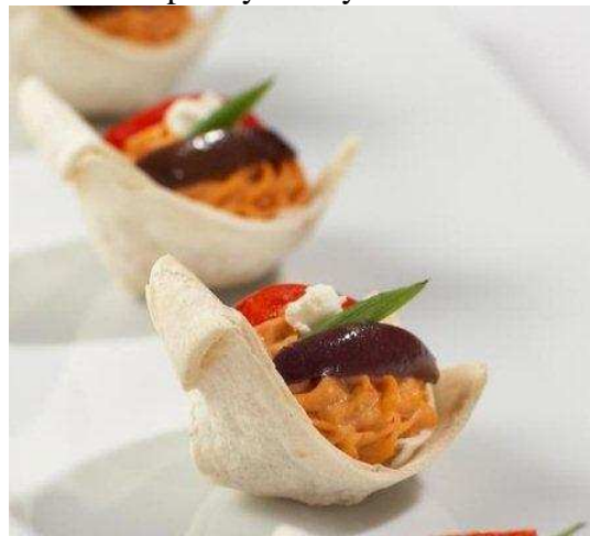
Roasted Red Pepper Humus Swans