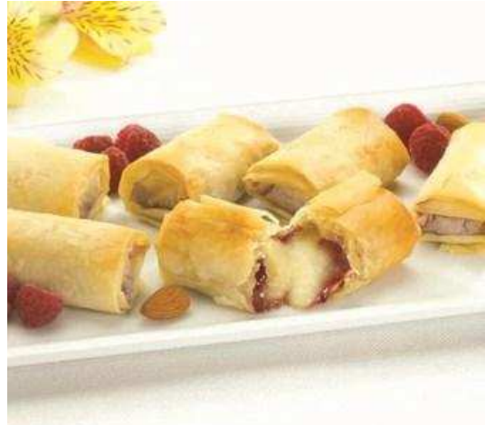
Brie & Raspberry in Phyllo