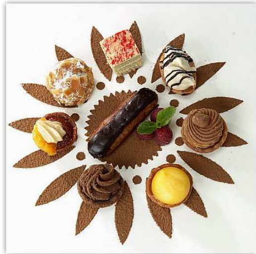
French Petit Fours

(818) 207-1649 (818) 363-8254 Fax www.ingridscatering.com