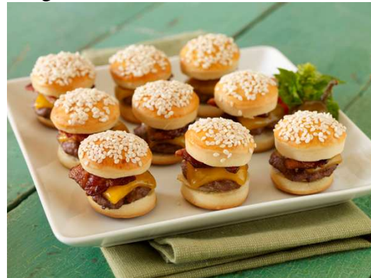
Mini Burger w/smoked bacon and cheese