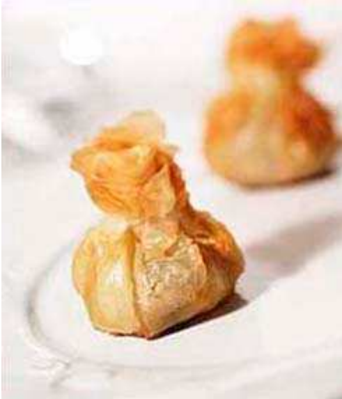
Fig & Goat Cheese in Phyllo