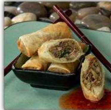
Peking Duck Rolls