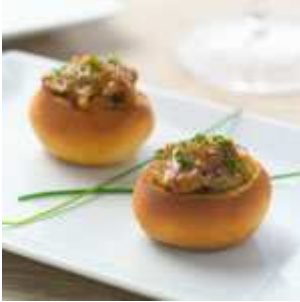
French Onion Soup