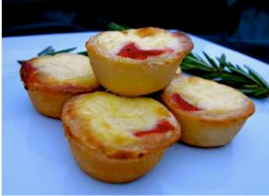
Quiche with Goat Cheese & Roasted red pepper