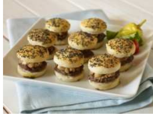
Mini Burger w/caramelized onion & Gorgonzola