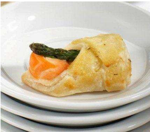
Honey Dijon Salmon & Asparagus