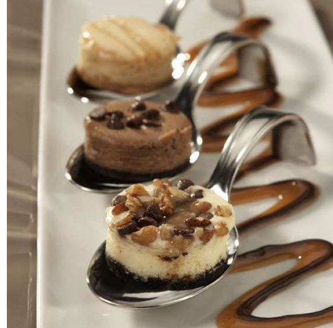
Mini Chocolate Caramel Cheesecake