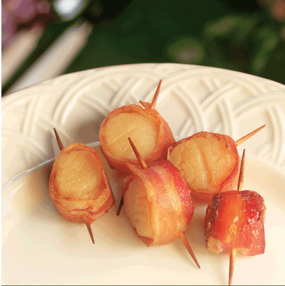
Scallops wrapped in Bacon