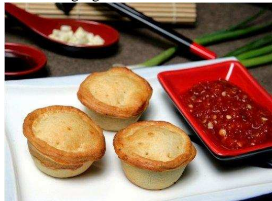
Asian Short Rib Pot Pie

(818) 207-1649 (818) 363-8254 Fax www.ingridscatering.com