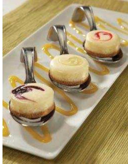
Mini Tropical Cheesecakes