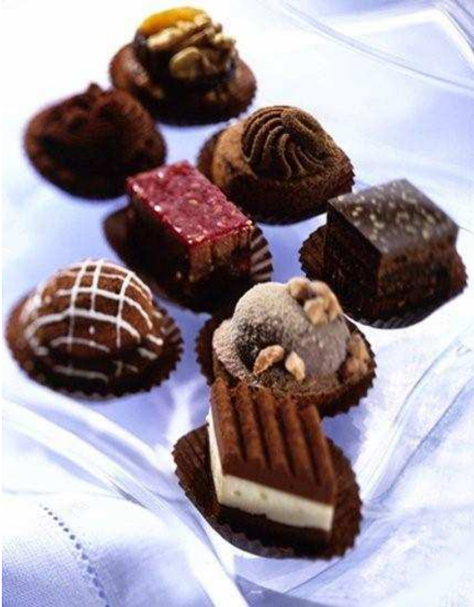
Mini Chocolate Petit Fours