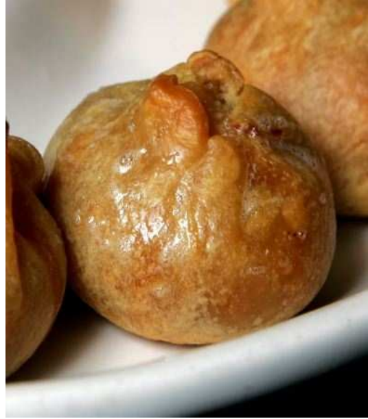
BBQ Pork in Biscuit