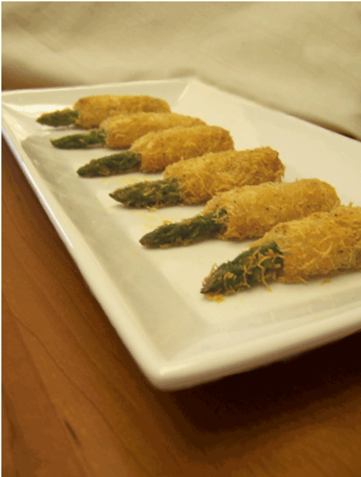
Crispy Asparagus with Asiago in Filo