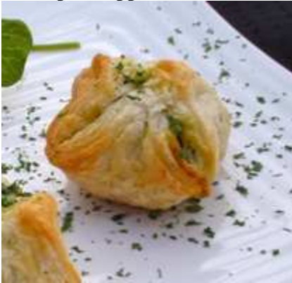
Salmon & Spinach Puff