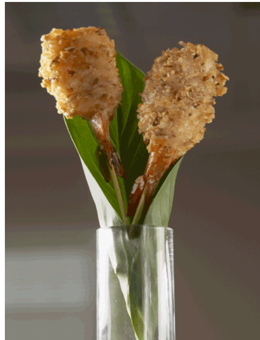
Butter Pecan Shrimp