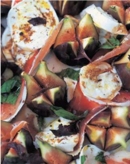
Fig Salad (Sexiest Salad)