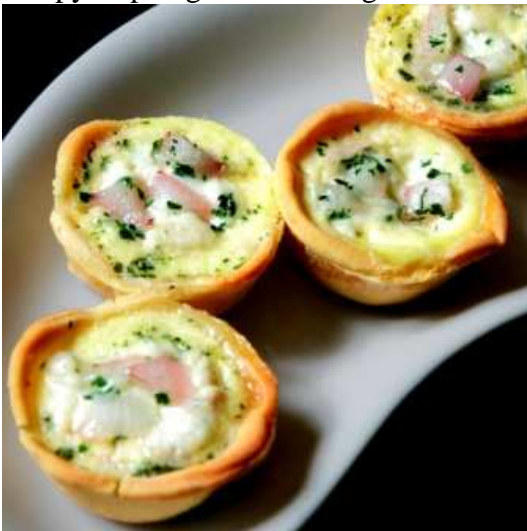
Mascarpone, Blue Cheese & red Onion